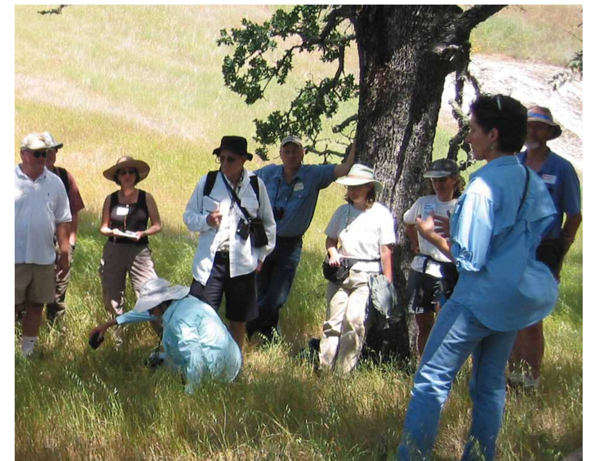
Outreach providers engage people of all ages in programs that educate about sustainability and foster stewardship of natural resources.