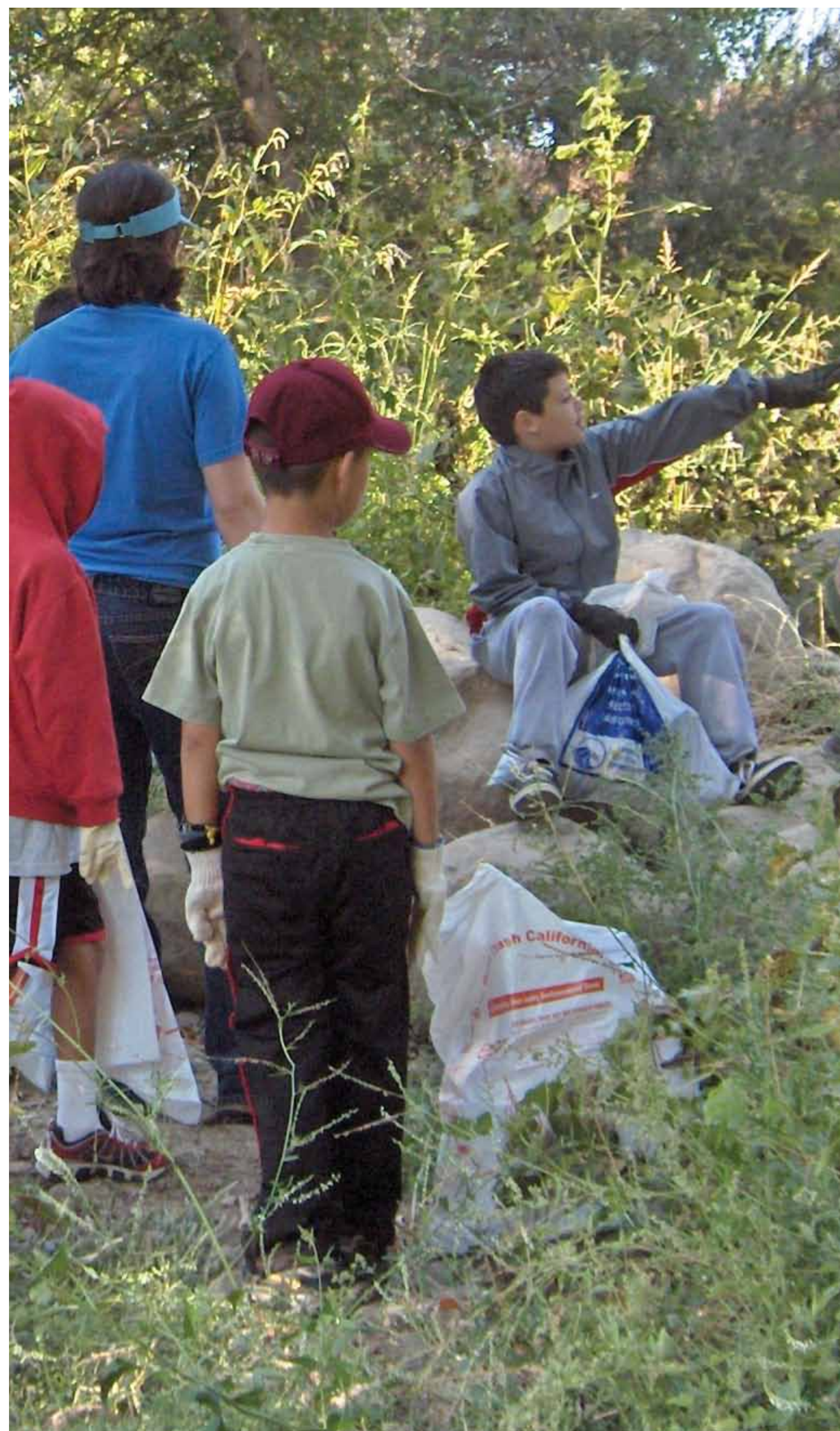
Graduate students, trained in JMIE's Environmental Leaders Program, help communities solve environmental problems, e.g. by reducing stormwater pollution.

THE MISSION of the John Muir Institute of the Environment (JMIE) is to strengthen the scientific foundation for environmental decision making, engage stakeholders, provide professional skills development for environmental careers, and act as a conduit of UC Davis environmental research between the university and policy makers, scientists, and the public.