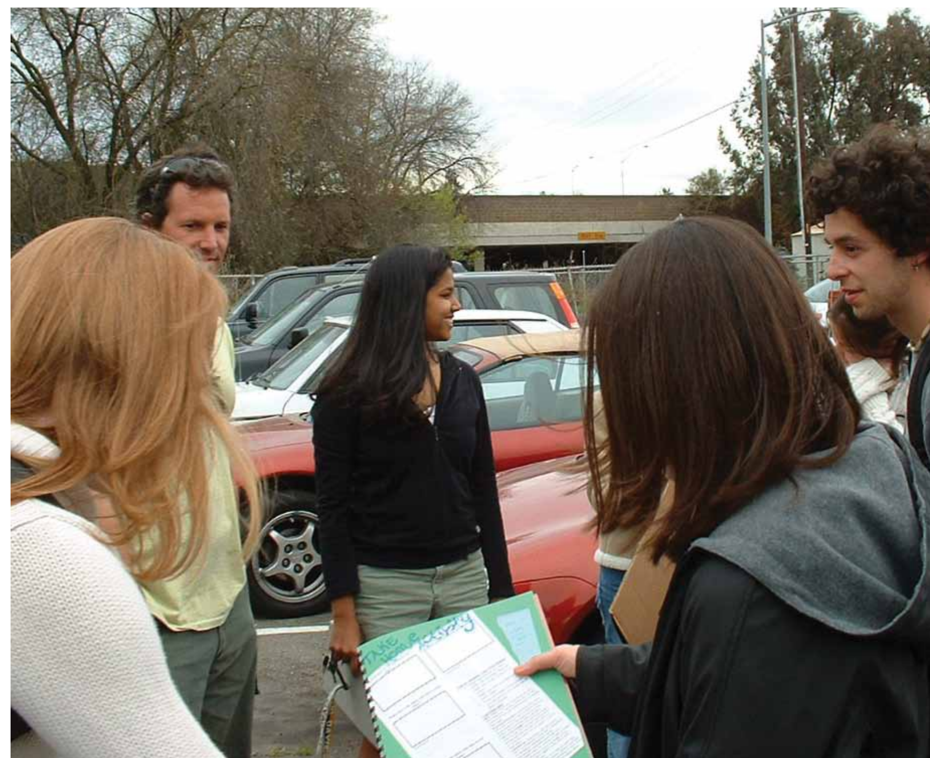
Faculty, staff, and students partner with the City of Davis to run the Cool Davis Initiative, a behavior change campaign to reduce GHG emissions.