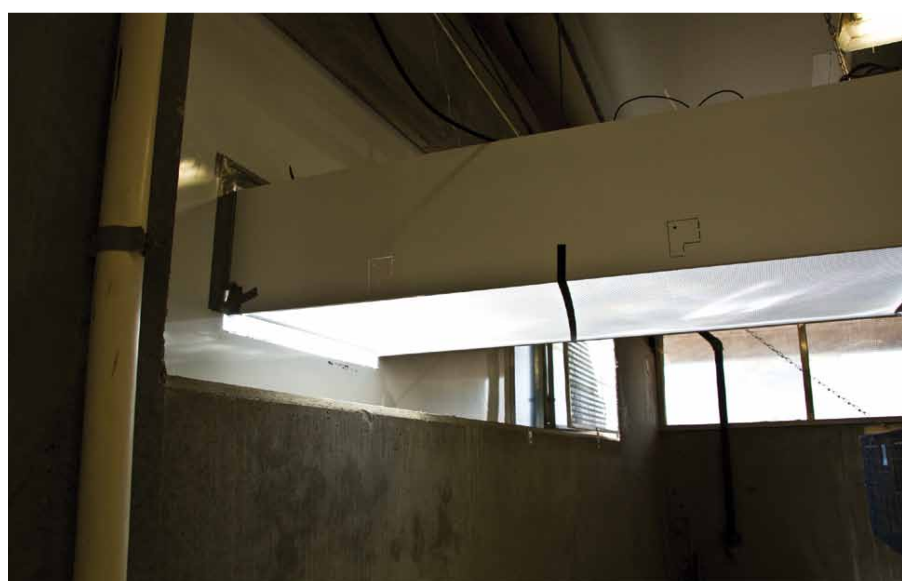
SunCentral core sunlighting system light guide interior view

ing system. CLTC recently installed the second SunCentral core sunlighting system in the United States on a Veterinary Medicine facility building at UC Davis. Another installation is planned. Both installations will be monitored to determine their annual performance on comfort, energy, peak electricity demand and occupant response for California's mid-Central Valley latitude and climate.