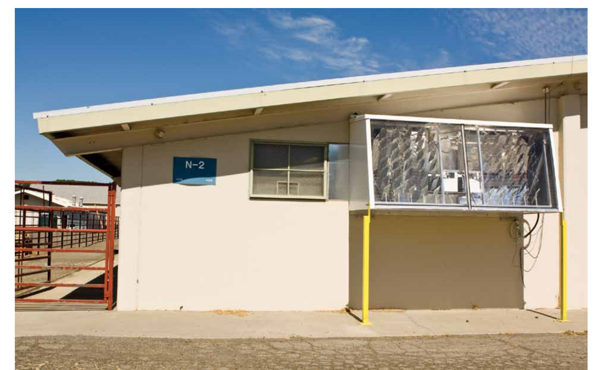
SunCentral core sunlighting system installation at the Veterinary Medicine Facility N-2 Building at UC Davis